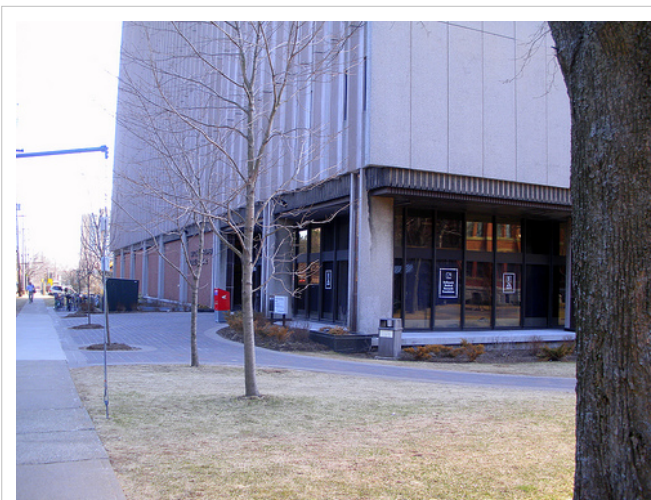
Sir Charles Tupper Medical Building, Dalhousie University

See also → New Brunswick health libraries , → List of Canadian health libraries & PubMedCentral Canada