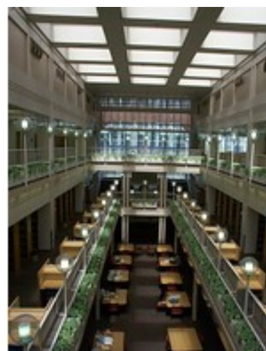
UofA's John W. Scott Health Sciences Library

4 floor, Fisher Bldg. 7007 14 Street SW Calgary, Alberta T2V 1P9