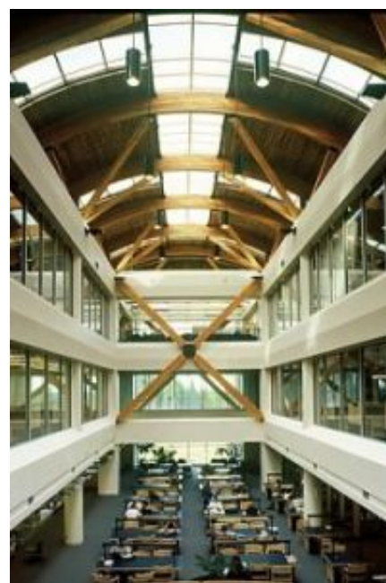
UNBC's Weller Library, Prince George BC

Kelowna General Hospital Henderson Library 2312 Pandosy St. Kelowna, BC V1Y 1T3 250-862-4000 x7296 http://www.interiorhealth.ca/choose-health.aspx?id=238