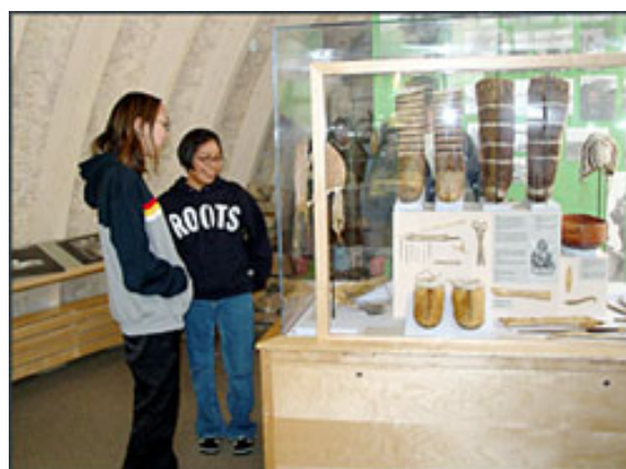
A display at the Kitikmeot Heritage Society in Cambridge Bay

See also → List of Canadian health libraries & PubMedCentral Canada